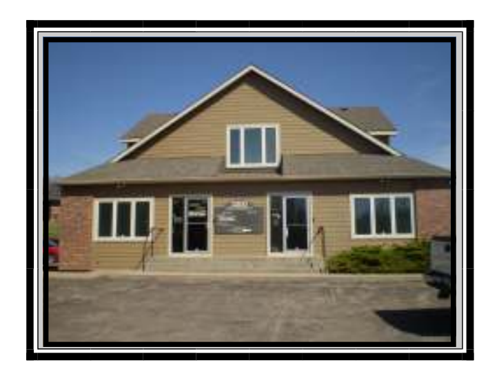
Front of building, our entrance is on the east side