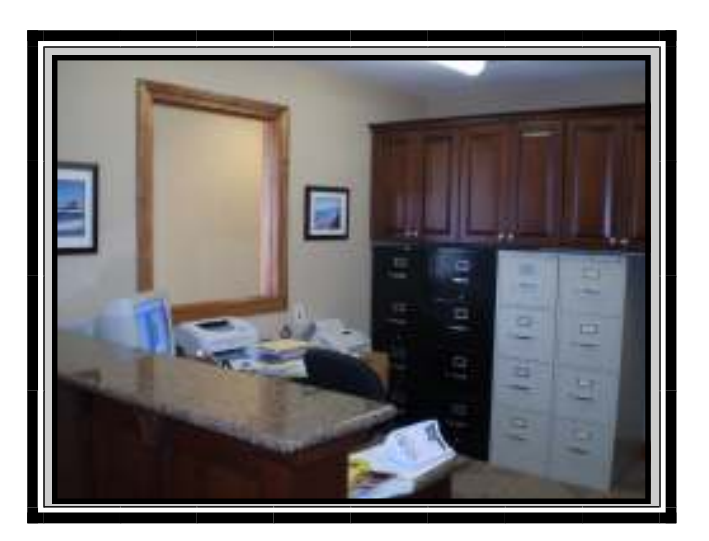
Reception area inside the Five Rivers Office