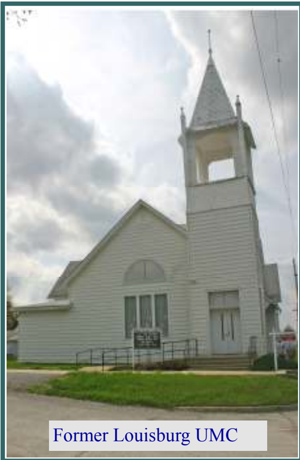
Former Louisburg UMC