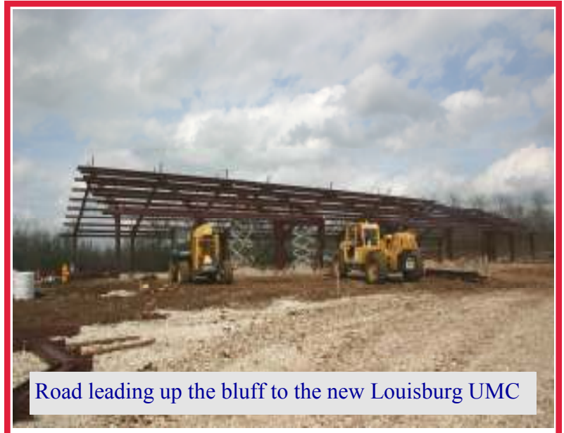
Road leading up the bluff to the new Louisburg UMC