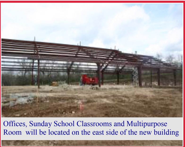
Offices, Sunday School Classrooms and Multipurpose Room will be located on the east side of the new building

Rev. Voteau plans to hold the churches sunrise service at the new church. She finds humor in the fact that Resurrection Sunday will be at the resurrection site of the new church.