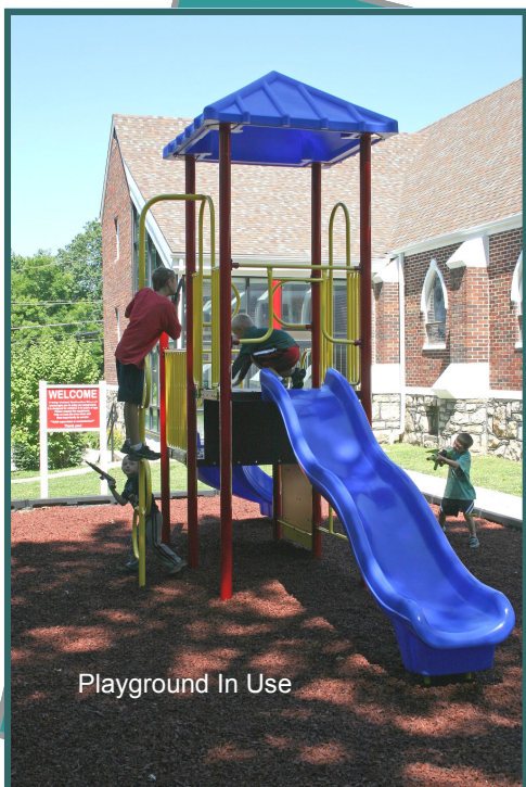
Playground In Use