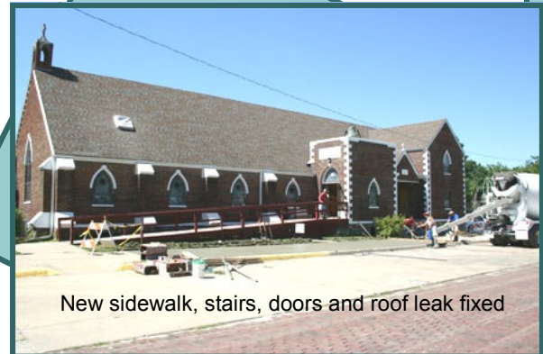
New sidewalk, stairs, doors and roof leak fixed

Carved into a white stone above the entrance to Trinity in 1951 are two sentences. Meet with us to worship. Depart with us to serve. Good words for any church. Trinity is working to make their church interior and exterior more assessable and a more inviting place to worship. This is in keeping with their mission statement: Inviting, nurturing and equipping all persons to be disciples of Jesus Christ.