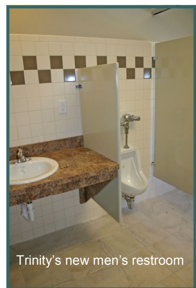
Trinity's new men's restroom