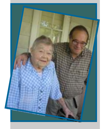
"Life is half spent before we know what it is"