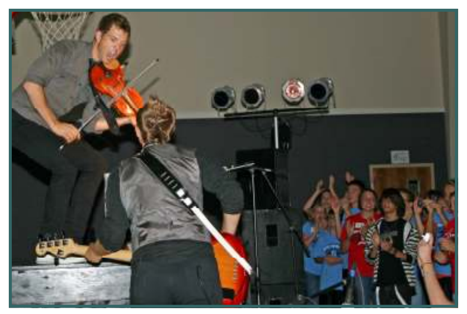
Article One concert began at 9:00 p.m.